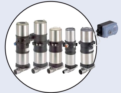
Diaphragm control valve Continuous ELEMENT system Type 8802-DF

The design of the System Type 8802 Continuous ELEMENT enables the easy integration of digital automation modules whether they are simple Positioner Basic, high-capacity Positioner with optional integrated fieldbus interface or even a digital Process Controller with easy handling thanks to the backlighting of the graphics display.