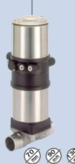
Valve system Continuous ELEMENT Type 8802-DF-L 2103 + 8694 (actuator sizes \varnothing 70/90/130 mm)