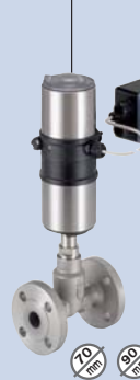
Valve system Continuous ELEMENT Type 8802-GD-P 2301 + 8792 / Type 8802-GD-Q 2301 + 8793 (actuator sizes \varnothing 70/90/130 mm)

For the configuration of further valve systems please use the "Request for quotation" in the datasheet 2301_8802-GD