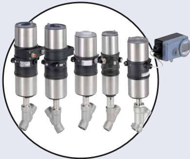
Angle-seat control valve Continuous ELEMENT system Type 8802-YG