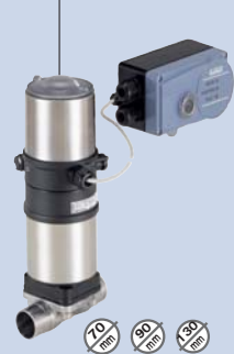
Valve system Continuous ELEMENT Type 8802-DF-P 2103 + 8792 / Type 8802-DF-Q 2103 + 8793 (actuator sizes \varnothing 70/90/130 mm)

For the configuration of further valve systems please use the "Request for quotation" in the datasheet 2103_8802-DF