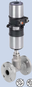
Valve system Continuous ELEMENT Type 8802-GD-I 2301 + 8692 (actuator sizes \varnothing 70/90/130 mm)