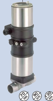
Valve system Continuous ELEMENT Type 8802-DF-J 2103 + 8693 (actuator sizes \varnothing 70/90/130 mm)