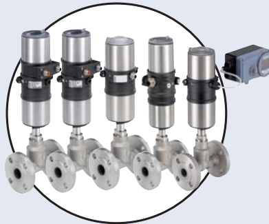
Globe control valve Continuous ELEMENT system Type 8802-GD