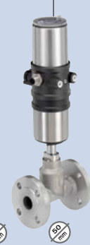
Valve system Continuous ELEMENT Type 8802-GD-M 2301 + 8696 (actuator sizes \varnothing 50 mm)