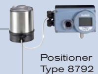
Positioner Type 8792 Process Controller Type 8793